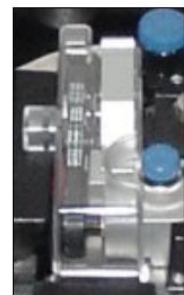
Clear Protective Mechanism Cover (models S-40 & S-45)