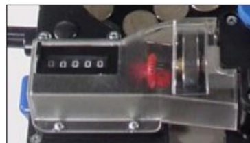
Clear Protective Mechanism Cover (models S-15, S-25 & S-35)

At Semacon, the safety of our customers is one of our highest priorities! Our counters incorporate numerous safety features, such as a clear protective cover over the feed wheel or feed belt that allows the operator to observe the mechanism and access the feed system.