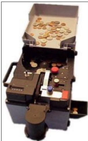
S-45 shown with offsort tray

The bottom line...Semacon coin counters will save you time so you will have more free time to do other things!