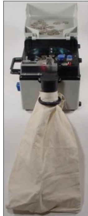
S-35 shown with bag holder

(Specifications are deemed to be accurate but are subject to change without notice)