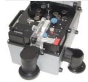
S-45 shown with dual bag holders for sorting coins